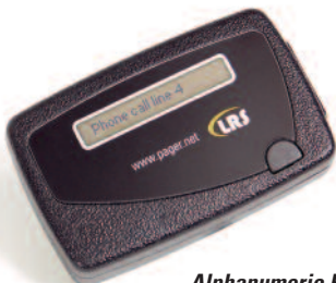
Alphanumeric Pager Two models to choose from

Butler II can also be used for staff-to-staff paging. Mount it at the front desk so the receptionist can call for the manager, trainers, massage therapists or other staff members when an appointment arrives.