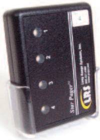
Nursery & Daycare Pagers Nine models to choose from