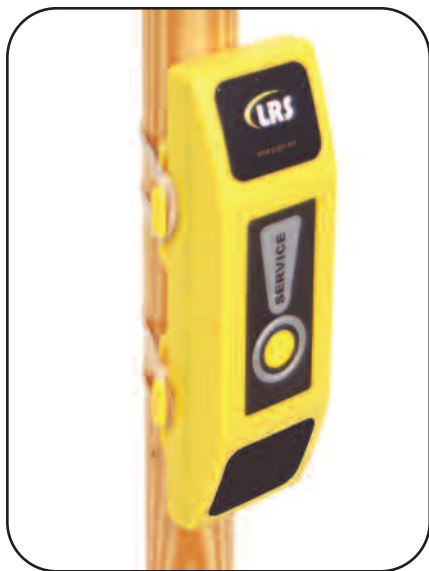
Beach Butler can also be mounted with rubber bands, Velcro strips or optional umbrella clip.