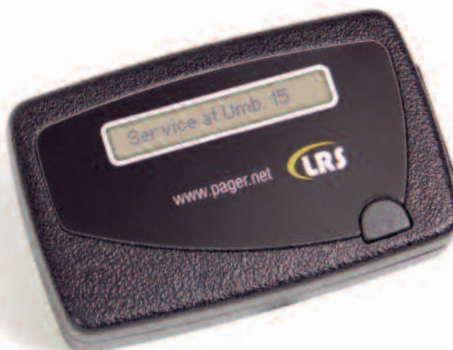
1-Line Rechargeable Alphanumeric