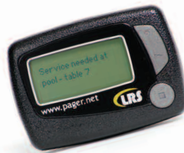
4-Line Battery-Operated Alphanumeric