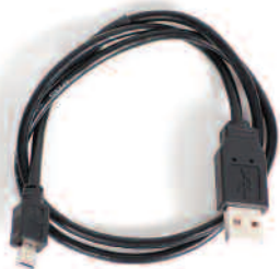
Programming CD (not shown) and cable.

Beach Butler works with both LRS Alphanumeric pagers.